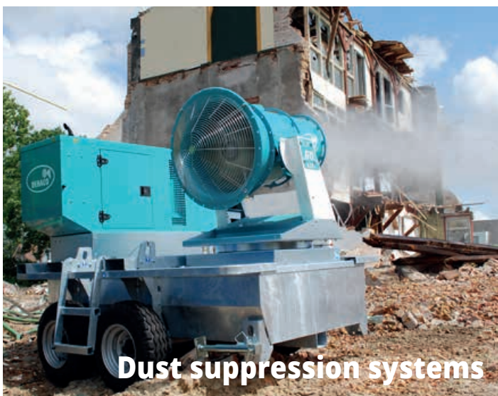
Dust suppression systems